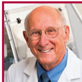
Steven Rosenberg, M.D., Ph.D. , was the recipient of the 2016 Novartis Prize for Clinical Immunology.